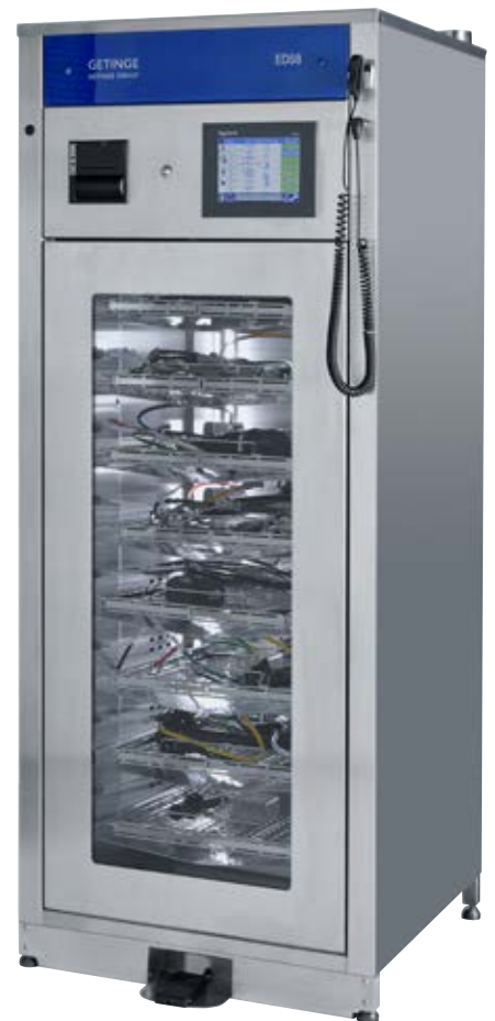
Getinge EDS8 drying and storage cabinet