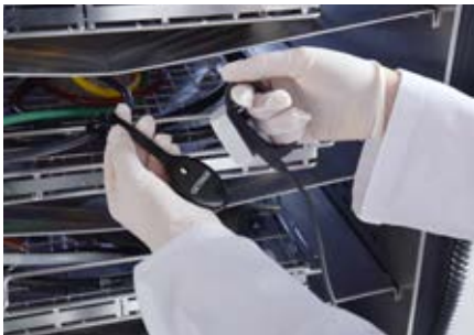
RFID scanner for enhanced safety