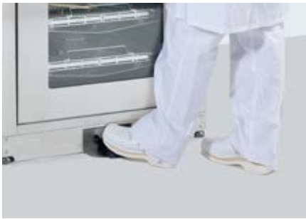
Foot pedal for hands-free operation