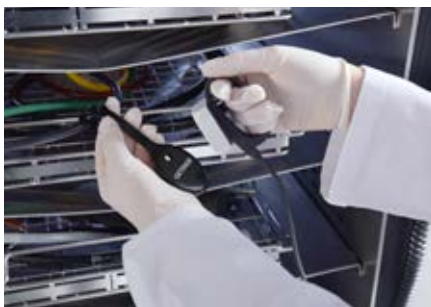
RFID scanner for enhanced safety