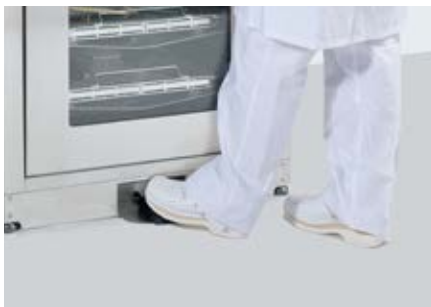
Foot pedal for hands-free operation