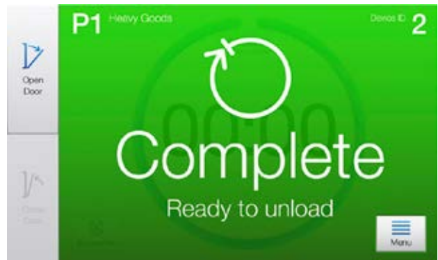
CENTRIC provides clear, uncluttered information – only what you normally need at any particular stage, nothing more.