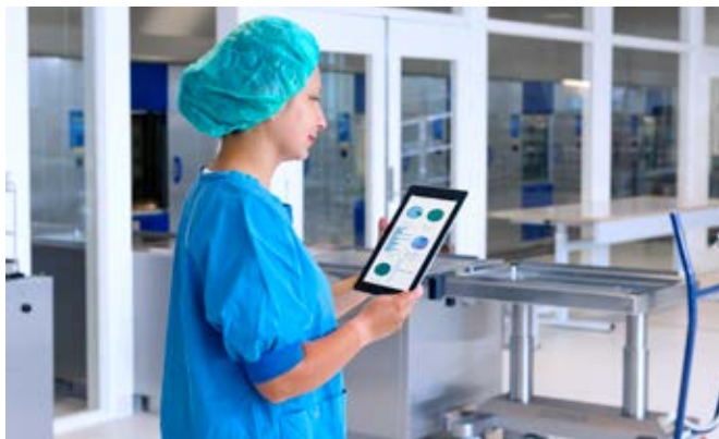
Getinge Online enables fast, proactive troubleshooting to keep you up and running.

With easy access to data, work routines are optimized and equipment uptime is ensured.