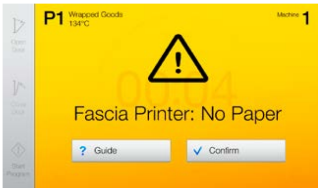
CENTRIC provides clear, easy-to-understand online help for problem-solving or accessing advanced features.