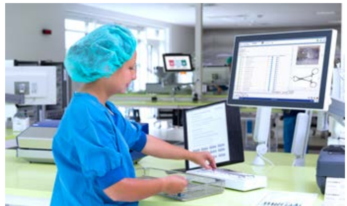
Ensure full traceability to patient with T-DOC.

T-DOC enables production planning in the CSSD according to the scheduled operations, thereby optimizing the sterile workflow. Interfacing with all types of hospital systems, T-DOC offers the ability to deliver optimized patient-specific case carts incl. consumables and own products, financial planning and advanced reporting, as well as an overall promise to deliver on cost efficiency and patient safety.