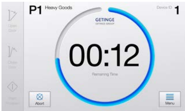
Status at a glance. Easy to see the time remaining, even from a distance.

The large, high-resolution screens are easy to read, enabling staff to see and monitor status from a distance, thereby improving user satisfaction and productivity. With CENTRIC, Getinge takes another huge step forward in providing innovative, integrated solutions with a user-centric focus.