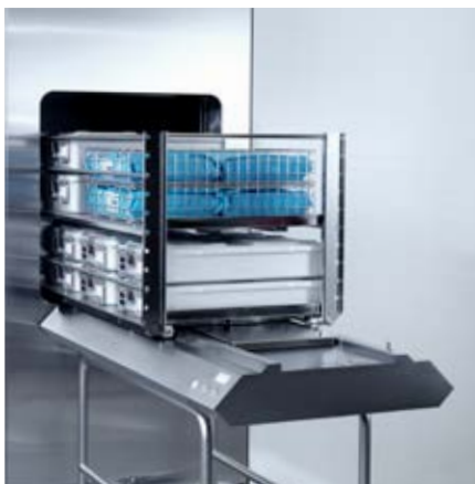
Automatic loader and unloader for Shelf Racks (GL64SR).

These are specially formulated to maximize the performance of your Getinge equipment. Getinge GSS67H is fully compatible with our Getinge Assured Bowie-Dick tests, which we recommend using with your new sterilizer.