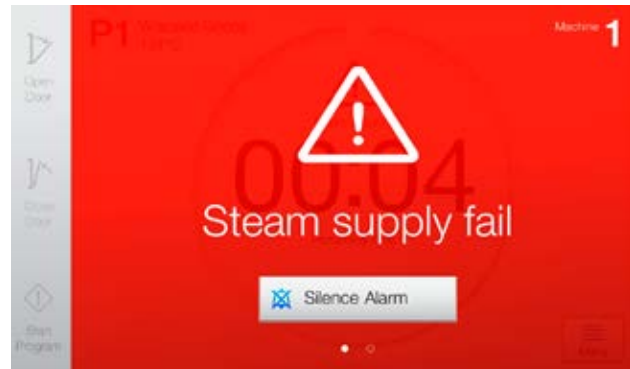
Every triggered alarm comes with clear onscreen directions for what action to take. No confusion, no stress, no time wasted.