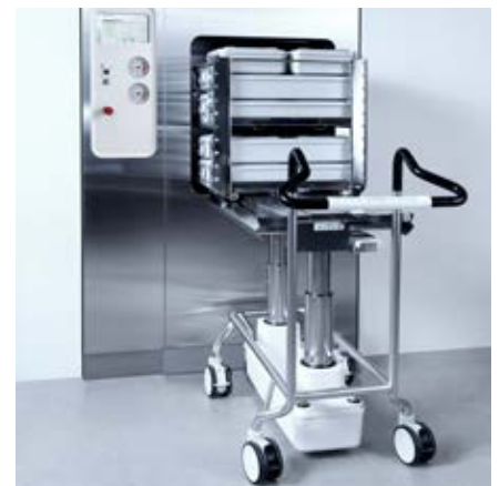
SMART loading/unloading trollies.