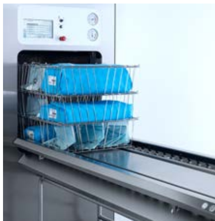
Automatic loader and unloader for Baskets (GL64B).